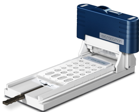
Figure 1 EXTRACTMAN ®

Dynabeads ® , Protein G for Immunoprecipitation (Invitrogen), SureBeads ™ Protein G Magnetic Beads (Bio-Rad) and Pierce ™ Protein G Magnetic Beads were pre-bound to mAb 8RB13 by washing 20 \mu L of beads four times with 200 \mu L IP Buffer (Tris-Buffered Saline + 0.01% Triton X-100) using a magnetic rack and then incubated with 50 \mu g/mL mAb 8RB13 in IP buffer at room temperature for 20 minutes with gentle mixing every five minutes. mAb 8RB13 is a polyol-responsive antibody that binds the 8RB13 epitope present in many bacterial RNA polymerases. 3